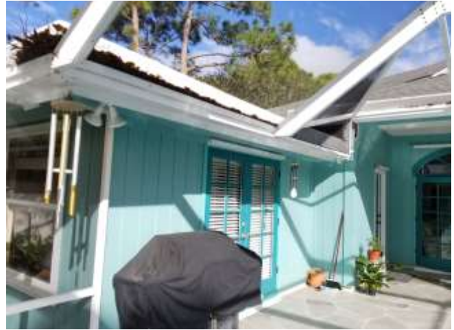
Views of home and shutters protection