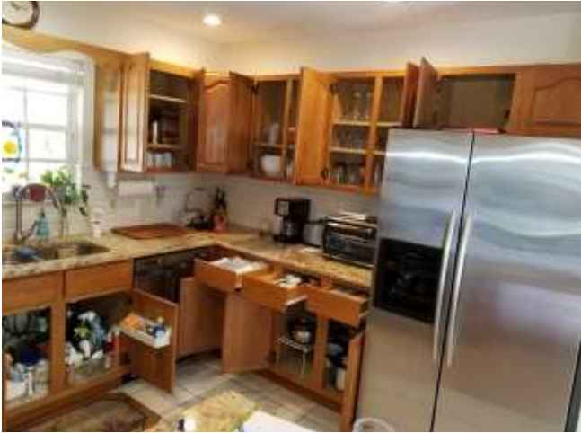
View of kitchen