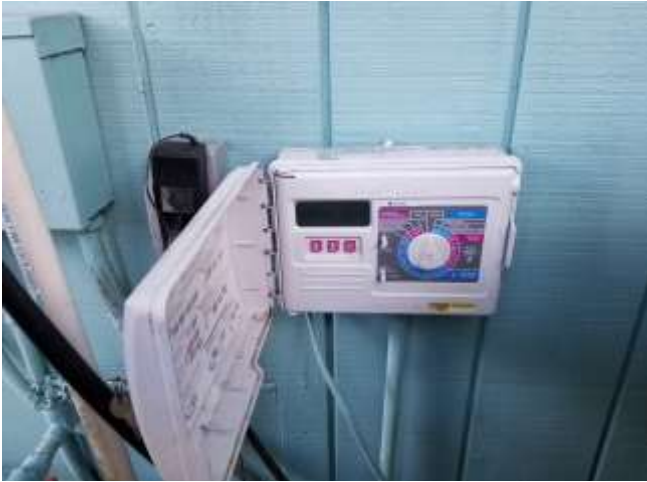
Programmable Rain Bird brand clock, served by a well located n the west side of the house.