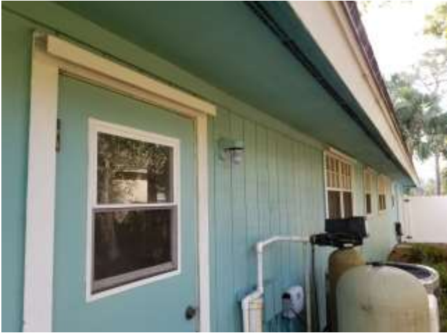
The coach light on the garage rear door was missing it's globe and did not light.