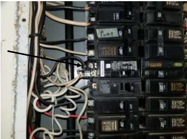
There is a GFCI type breaker in the panel box which appears replaced and serves the east side bath and exterior outlets.