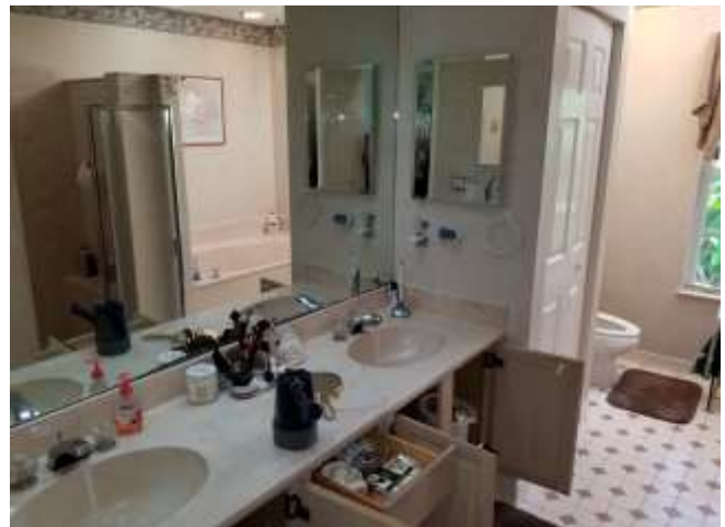
View of bath