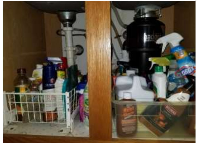
View under sink