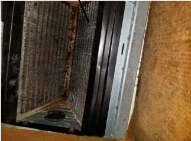
The air handler coils were clean