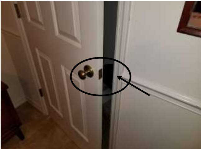
*In both east bedrooms one of the closet doors lock knobs latch did not engage the strike plate on the jamb.