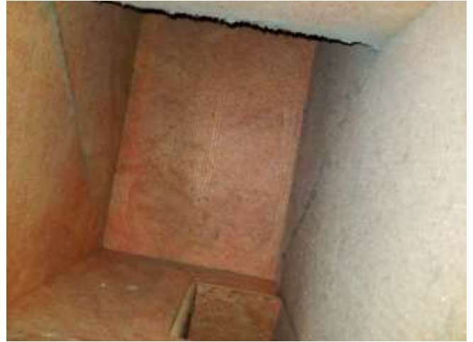
The AC ducts were clean.