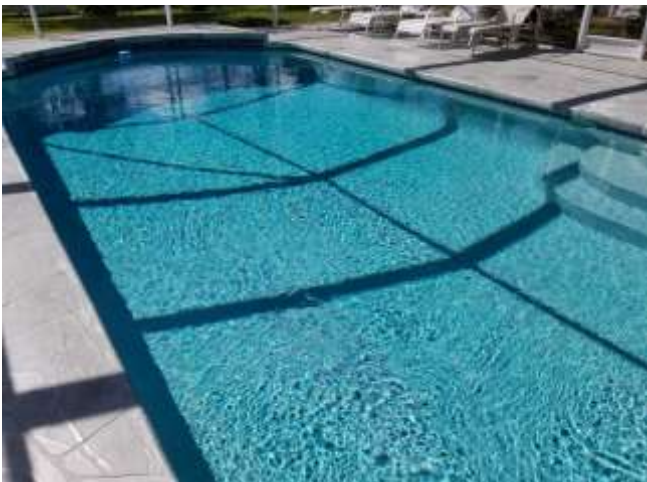
The pool is not tested for leaks as a quality test requires a number of days to monitor the water level and getting into the pool to inject dye around all of the inputs, out-posts and lights do detect leaks.