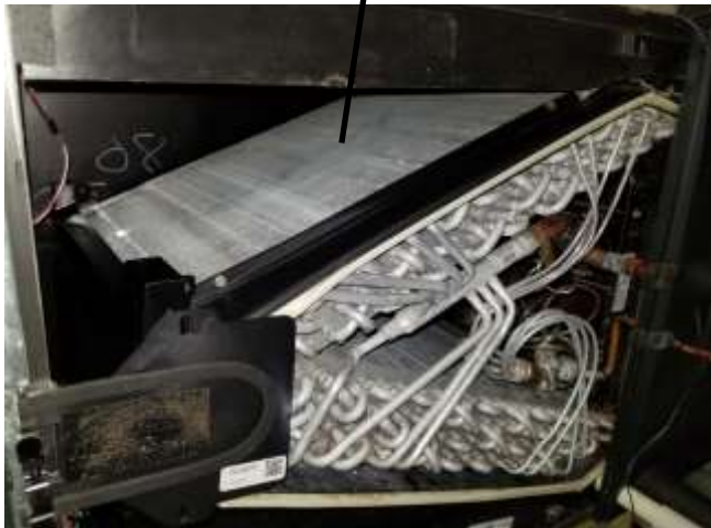
The air handler coils were clean