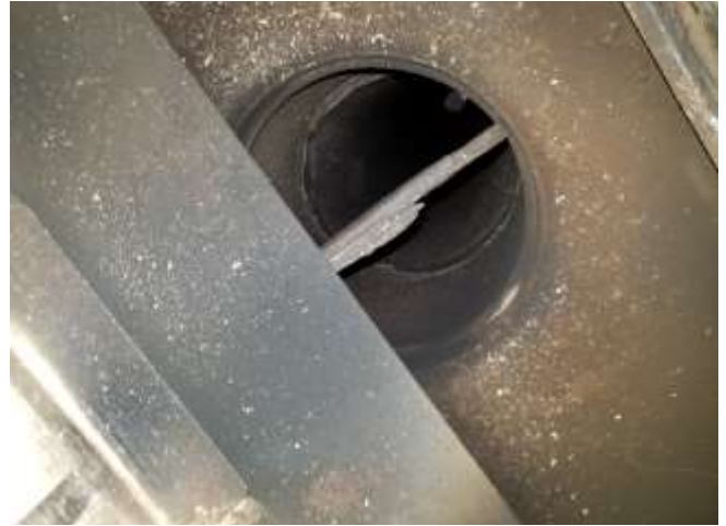
The fireplace damper functioned.