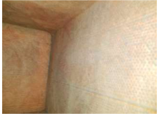
The AC ducts were clean.