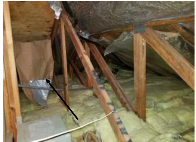
Some of the foil insulation stapled to the underside of the roof is hanging loose. This is typical with age.