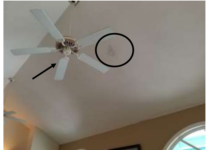
A repair was noted in the living room ceiling. The owner stated a projection TV was hung from that location and it needs to be painted.