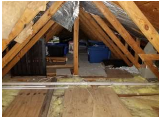
Views in attic