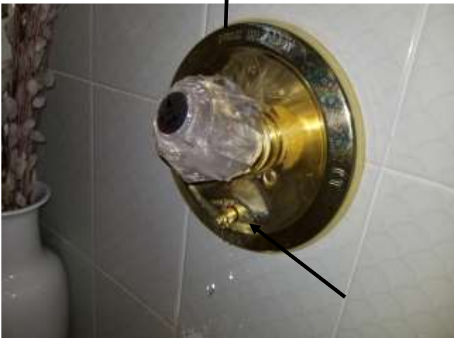
In the east hall bath tub water drips from the faucet handle when on.