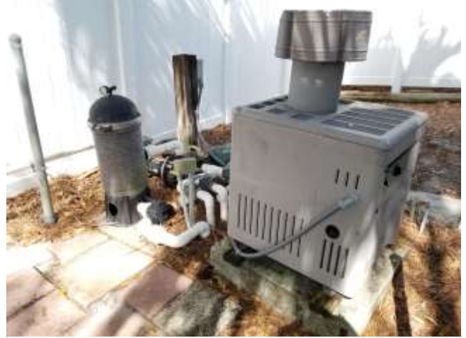
The pools finish was good, the light was lit and a water fall function was noted to work. The pool motor and filter appeared older and possibly original but no defect was noted. The pools gas heater did not start.