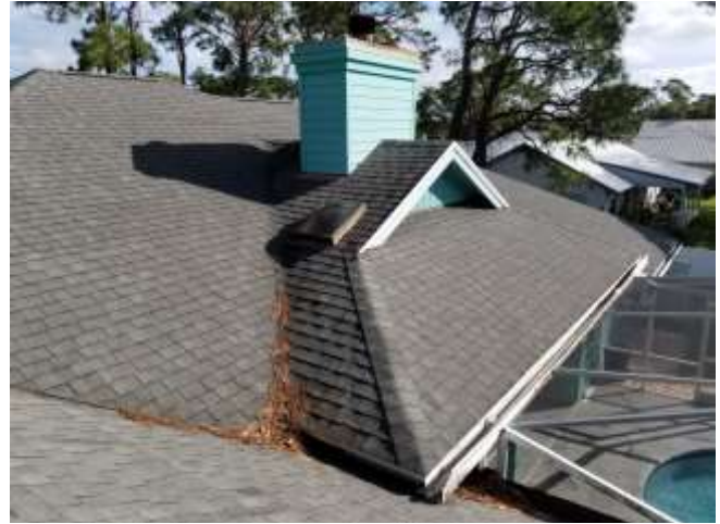
Views of Roof Permitted December 14, 2004 Pmt# BRR 2004120878