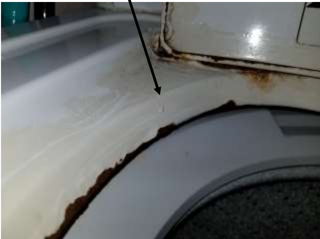
On the cloths washer some rust and painting was noted on the lid and around the washer baskets rim.