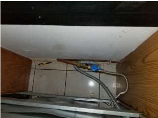
View behind oven

No anti-tip foot was noted installed under the rear leg of the stove. This bracket prevents newer and lighter stoves from tipping over if both trays are pulled out