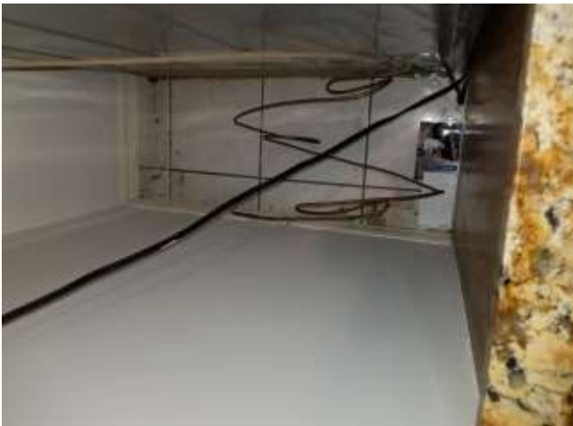
View behind refrigerator