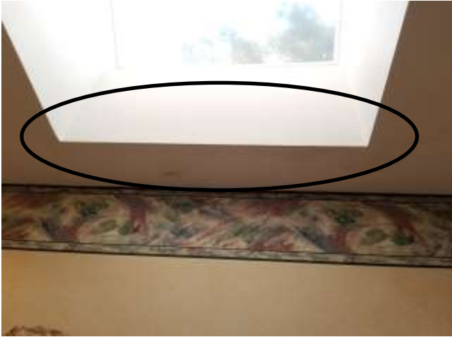
In the east hall bath some staining was noted on the ceiling at the base of the skylight. No moisture or damage was observed and it is thought to be from the old skylight.