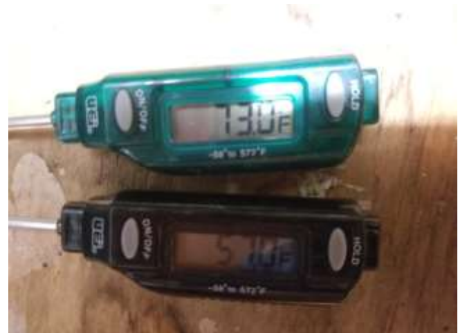
The temperature differential was 16 deg.