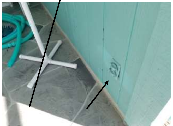
The exterior and garage outlets are not GFCI protected and should be since 1975. *There is a GFCI type outlet on the patio by the family room door which did not trip off when tested. *The outlets on the exterior front and east side have their black and white wires connected in reverse. The outlet on the patios master bedroom wall is loosely secured to the electric box.