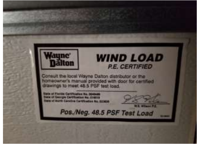
Views of home and shutters protection