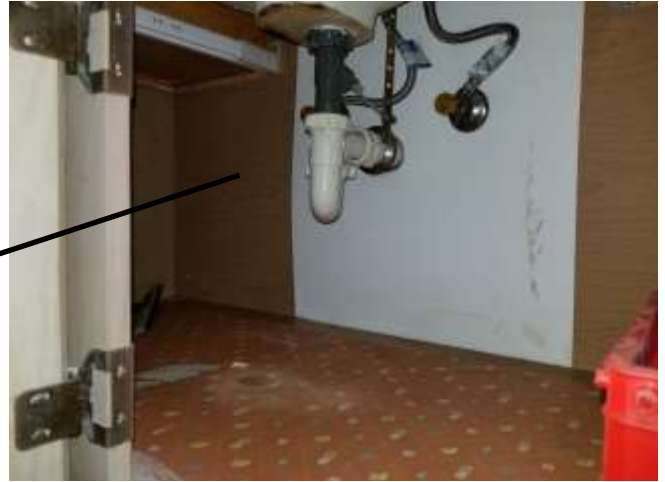
Views of baths