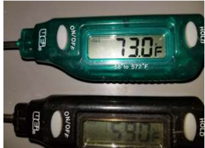
The temperature differential was 14 deg.