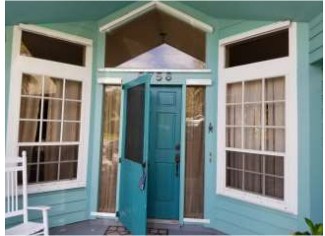
Views of home and shutters protection

Miami Dade hurricane rated corrugated shutters for all glazed openings (windows and doors). 3 skylights are replaced and are Miami Dade hurricane rated. The garage door is hurricane rated. The front entry door is not a glazed opening but is not hurricane rated as is an older style wood door.