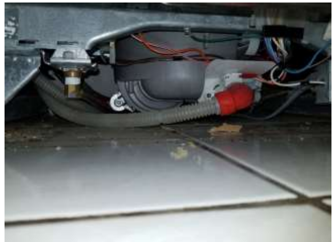
View under dishwasher

No anti-tip foot was noted installed under the rear leg of the stove. This bracket prevents newer and lighter stoves from tipping over if both trays are pulled out