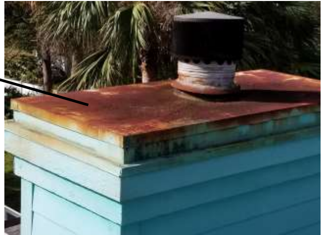
The chimney cap was sound and does not leak is but is rusting on its top. Properly cleaning, treating and painting will extend it's serviceable life.