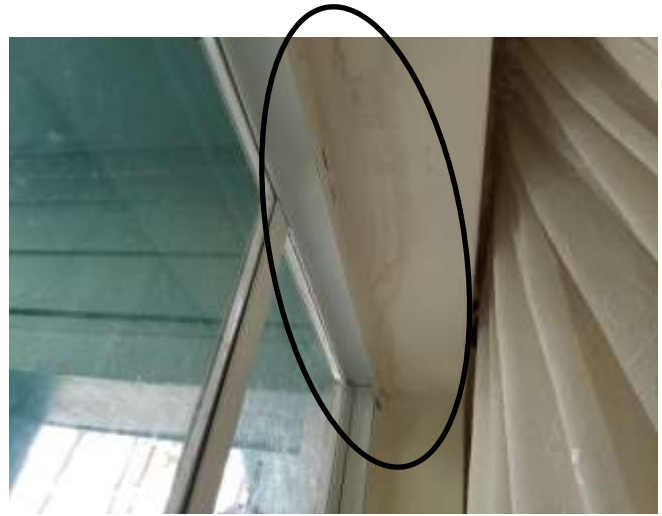
In the front window to the west of the entry door some staining was noted to the top of the frame. No moisture or damage was noted.