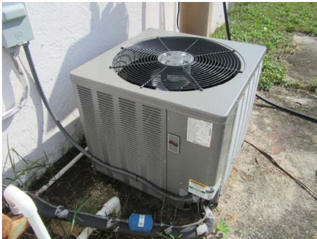
Ruud brand air condenser, manufactured 3/2014, 3 ton, located in the rear of the house.