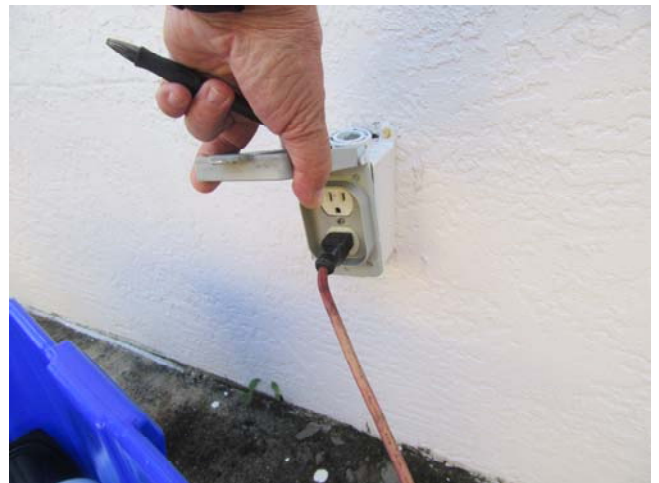
Kitchen and exterior outlets are not GFCI protected.