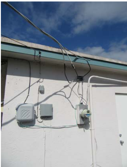
Overhead service with the meter located on the rear of the house. No ground wire was visible.