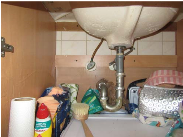
View under typical bath sink.