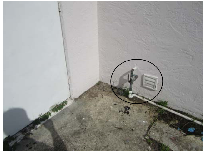
Main water shutoff valve located on the rear of the house.