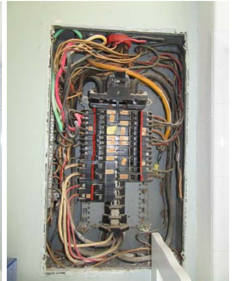
Federal Pacific brand electric panel with a 150 amp main breaker located in the hall bathroom. No tampering was noted.