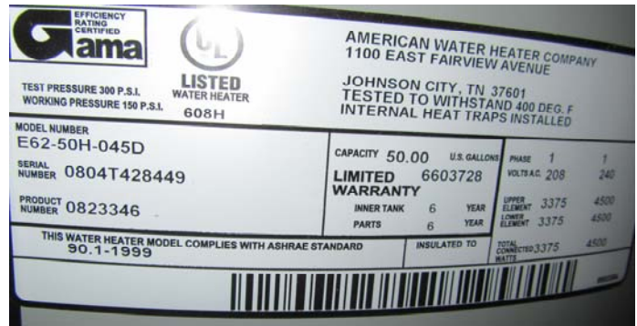
American brand heater located in the hall bath, manufactured 2008, 50 gallons.