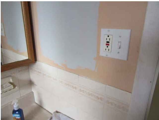
Bath outlets are GFCI protected.