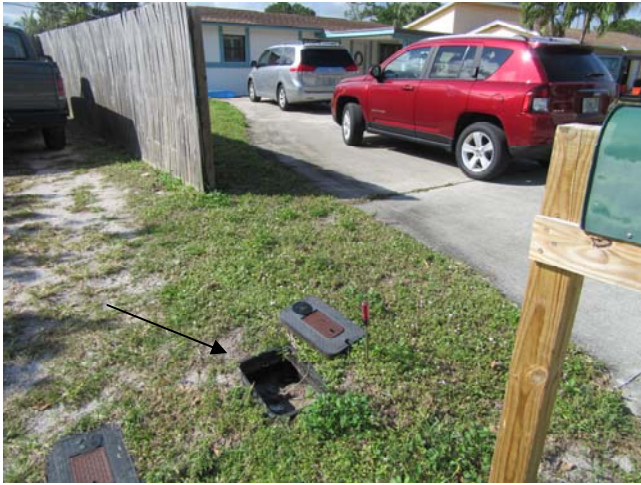
Water meter on the front south property line.