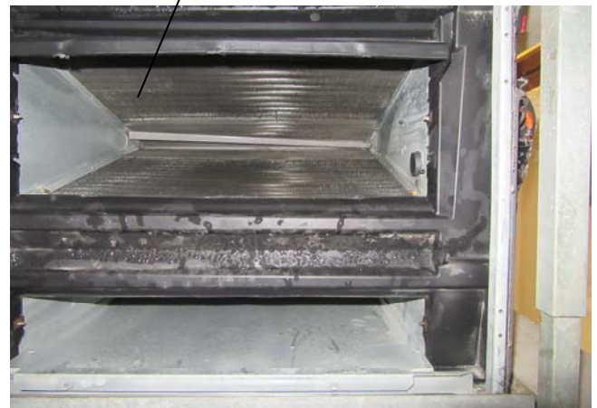
The air handler coils were clean.