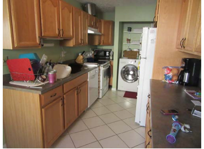
Views of remodeled baths and kitchen.