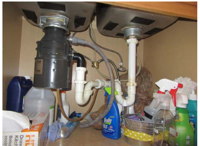
View under kitchen sink.