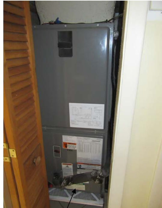
Ruud brand air handler located in the hall closet, manufactured 2/2014.